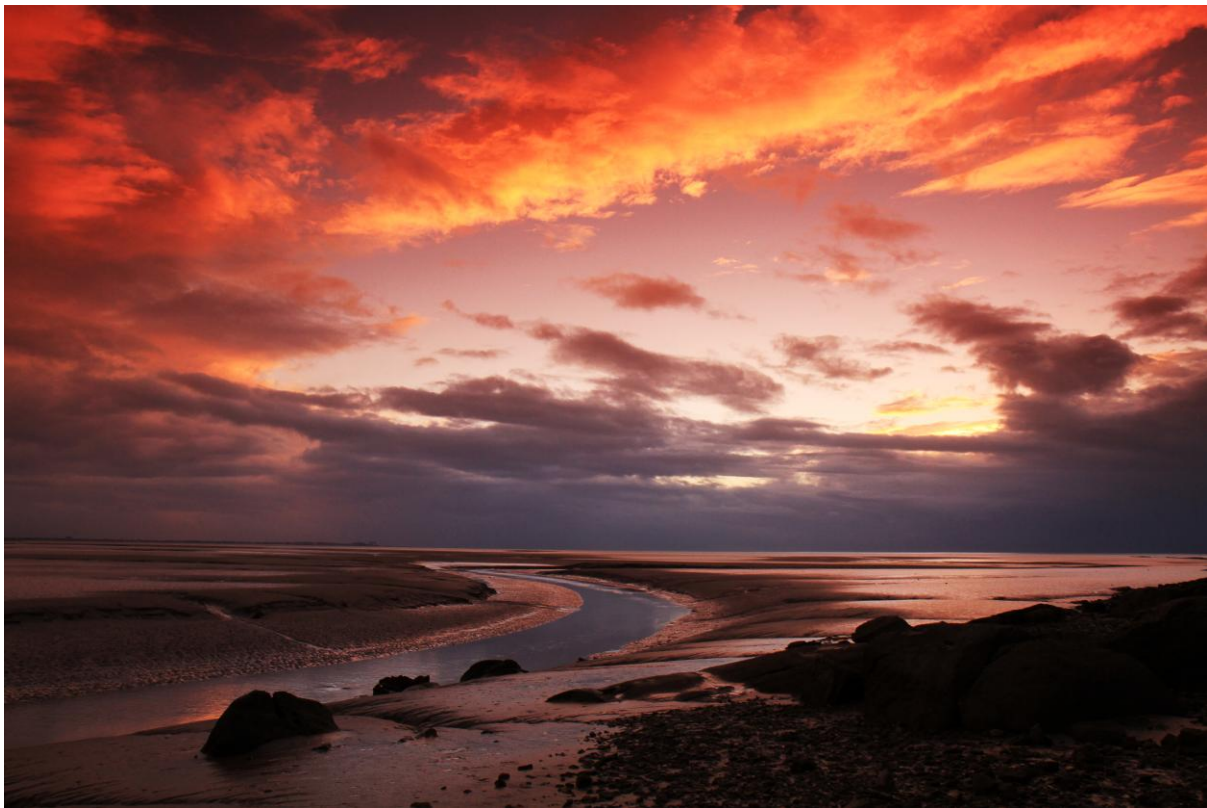
Silverdale coast at sunset

The Bay supports an outstanding diversity of wildlife. It is one of the UK's most important biodiversity hotspots. The extraordinary diversity of habitats mean the Bay is home to internationally significant populations of birds, flora, and invertebrates.