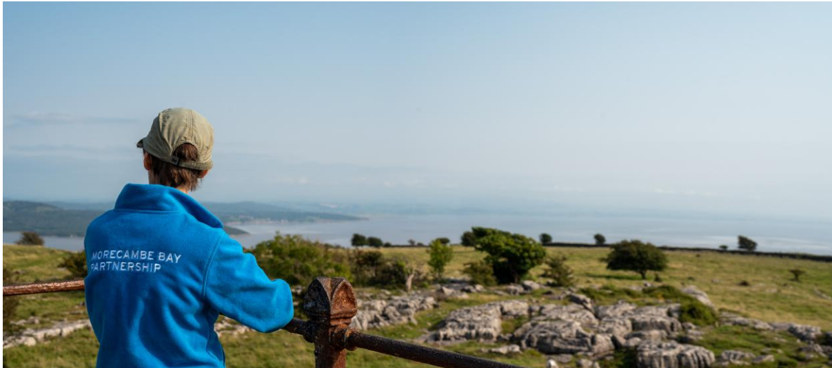
Morecambe Bay from Hampsfell