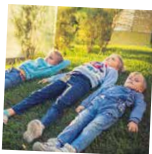
Visit Leighton Moss Nature Reserve