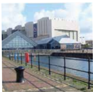
Visit the Dock Museum at Barrow