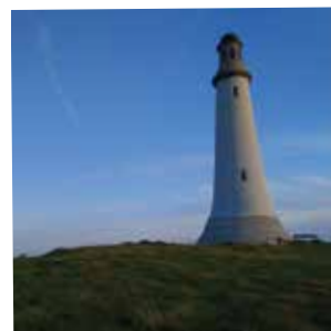
Enjoy a picnic at Hoad Monument, Ulverston