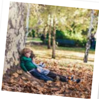
Hug a tree