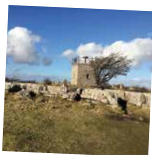
Take a hike to a headland beauty spot like Hampsfell