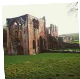
Visit a heritage site such as Furness Abbey