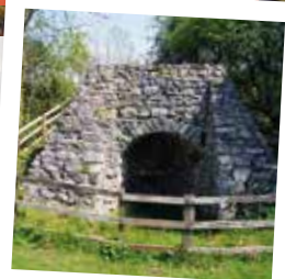
Are there any buildings like this lime kiln in the woods?

Are there any old buildings in the woods? What do you think they were used for?