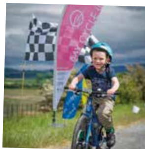
Go for a bike ride (try Lancaster - Glasson Dock)