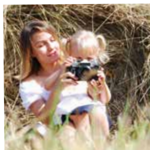
Take a photo or draw a picture of the Bay