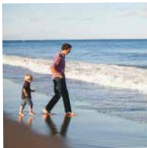
Visit Morecambe beach for a paddle in the sea