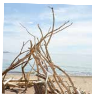
Make a den