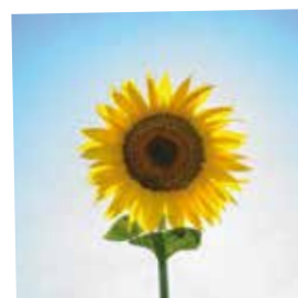
Sunflowers can grow really tall!

Brighten up your windowsill or garden by planting some seeds. What did you plant? How long was it until you could see them growing?