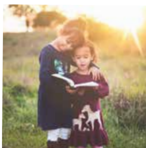
Sing a song outside