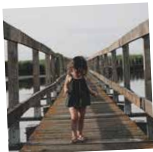
Play pooh sticks

Here are some adventure ideas, start from the beginning and work your way through. Tick off each idea when you complete it, how many can you tick off?