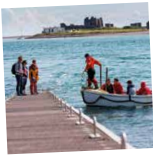
Take a boat ride out to Piel Island