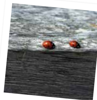
Go bug hunting