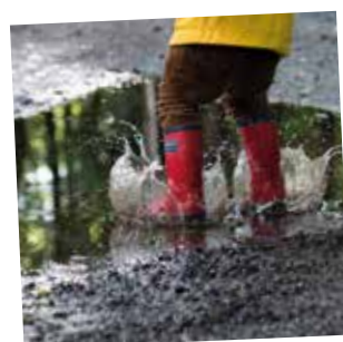
Jump in a puddle