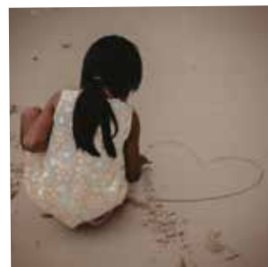
Make some wild art (Silverdale Cove is special)