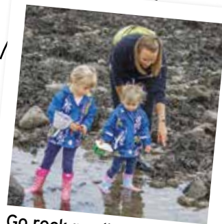
Go rock pooling (try Half Moon Bay, Heysham)